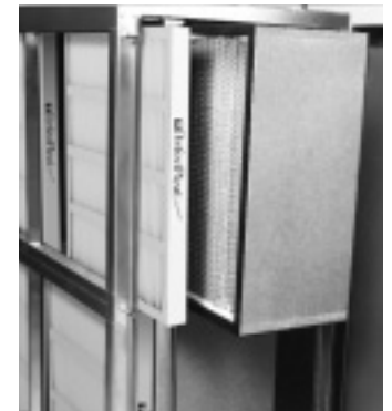
Two-inch PerfectPleat® pleated filters are shown installed in the prefilter track on the upstream end of the housing in front of AstroCel® HCX final filters.

Available in a wide range of efficiencies, cell side materials, and separator designs, AAF manufactures and tests AstroCel filters to fit HVAC HEPA housings.